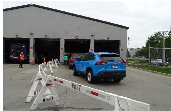
Photo 2: DART employees queue up to participate in drive through COVID-19 testing.