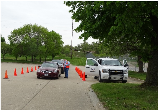
Photo 1: DART employee checks in with DART Safety Manager to be tested for COVID-19.